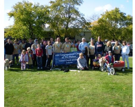
First Congregational sponsors teams for community fundraisers such as the CROP Walk and the American Cancer Society's Relay for Life.

At First Congregational, we'll walk with you on your spiritual journey ... respect what you believe rather than dictate what you should believe. It's dialog over monologue. Come and see for yourself.