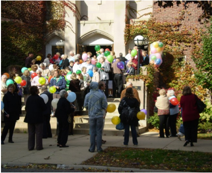
Anniversary Sunday balloon launch.