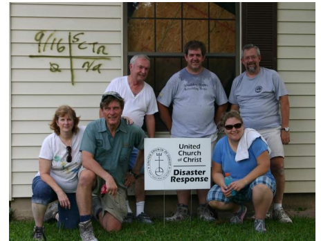
A group of church "missionaries" traveled to New Orleans this year to assist with the continuing rebuilding efforts after Hurricane Katrina.

For more information, call 847/299-5561 or email secretaries@fccdp.org