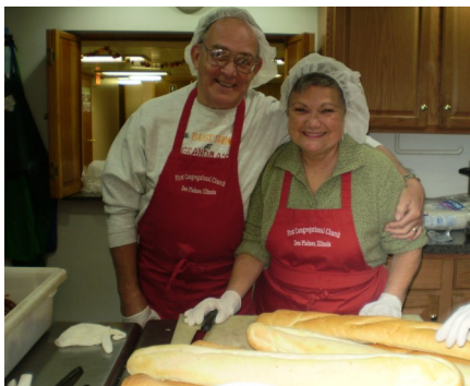
FCC volunteers help to prepare and serve a Thanksgiving meal at San Lucas UCC in Chicago's Humboldt Park neighborhood.

Our church founded the Self-Help Closet & Pantry in 1971. The pantry, located at 600 E. Algonquin Road in Des Plaines, remains a special mission of First Congregational Church.